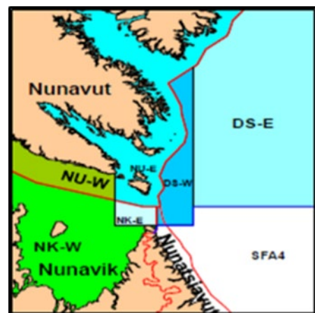
Figure 1 (b). Northern Shrimp Fishery Zones: • Eastern Assessment Zone “EAZ” (blue) • Western Assessment Zone “WAZ” (green)