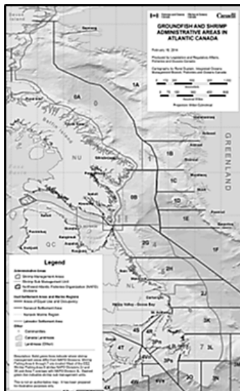
Figure 1 (a). Groundfish and shrimp administrative areas in Atlantic Canada

¥ See maps in Figure 1 (a) and (b) below.