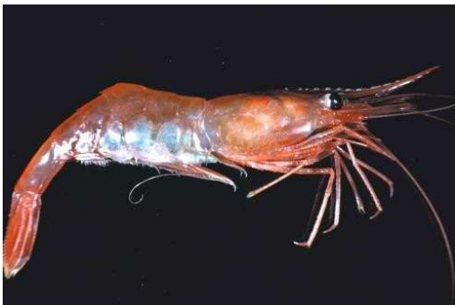
Northern shrimp ( Pandalus borealis )