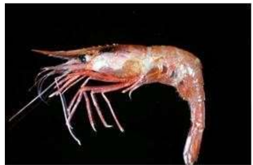
Striped shrimp ( Pandalus montagui )